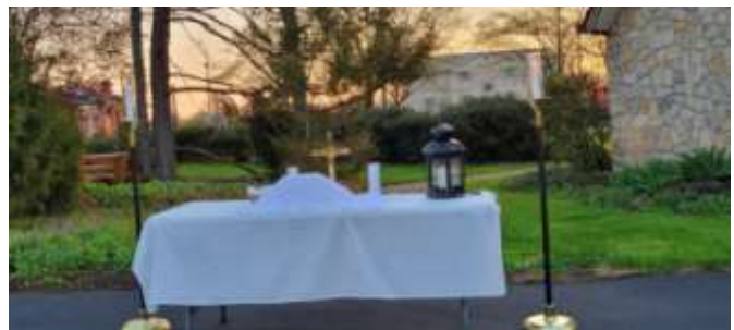
We're Thankful for... Communion at Table