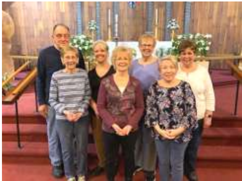
Thanks to our Altar Guild