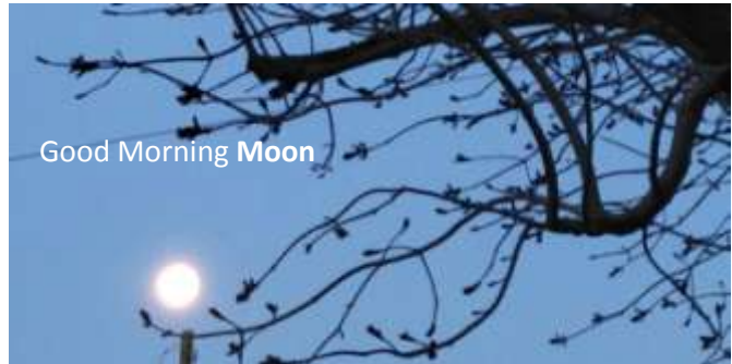
Good Morning Moon