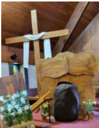
And our Easter Angels